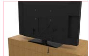
Cable connected to Display