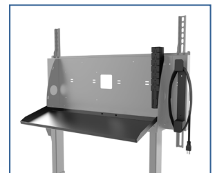
Rear Shelf, shown with optional accessories - Rear Laptop Shelf, 6 Outlet Surge Protector and Power Cord Manager

4" (102mm) swivel casters meet UL/CUL requirements