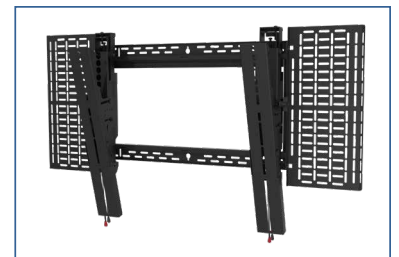
Shown with (2) optional ACC-UCM2 Universal AV Component Mounts