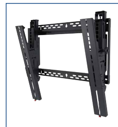
Fully adjustable +15/-2° tilt with IncreLok™